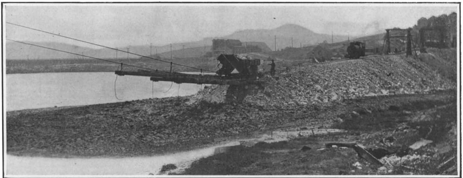
NEW METHOD OF MAKING A FILL BY DUMPING THE LOADED CARS FROM A SUSPENDED TRACK.

Several recent railway accidents in Germany have been traced to the failure of engine drivers to see signals, which circumstance has caused the Prussian