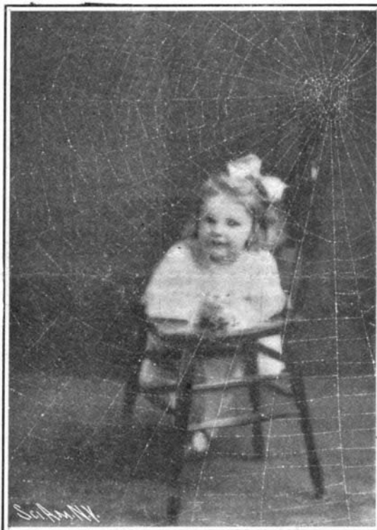
A SPIDER'S WEB PRINTED ON A PHOTOGRAPH.

the builder of this unique timepiece, has made use of five differently-colored slates, including the peach-bottom blue slate and the red, green, and purple slate of Vermont. These colors are blended very artistically together, and the 164 pieces, mostly in open-work de-