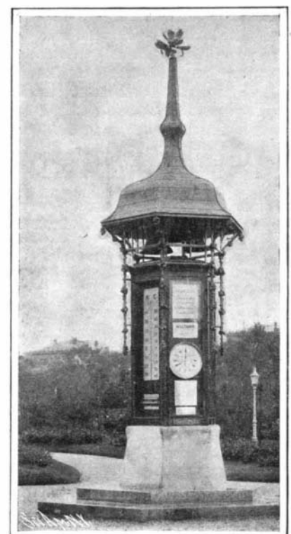
PUBLIC WEATHER TOWER IN VIENNA.