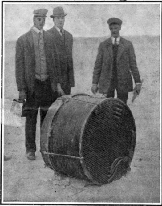
The Boiler of the Racer After the Accident.