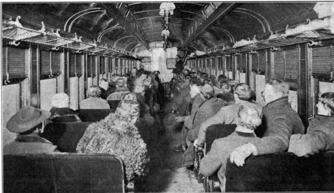
A PERIPATETIC LECTURE ROOM; WESTERN FARMERS ATTENDING AN AGRICULTURAL LECTURE IN A RAILROAD CAR.

The speed trial was followed by more interesting experiments, the object of which was to show that the casing surrounding the gasoline motor was perfectly watertight and, especially, to prove that the motor would stop automatically, as required by the Royal National Lifeboat Institution, if the boat should turn completely over and float with its keel in the air. It is scarcely necessary to insist upon the impor-