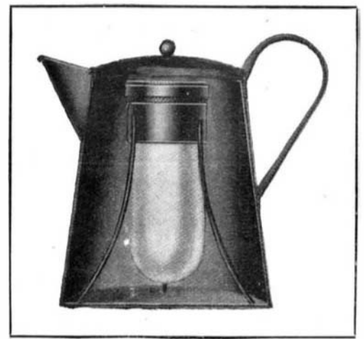
FILTER FOR COFFEE POTS

of the tube. A cover piece, also of muslin, is laid over the top of the bag, and its edge as well as that of the bag is clamped against the tube by means of a