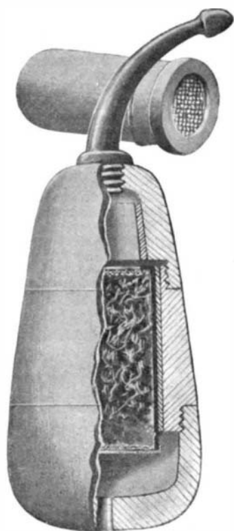
A NOVEL TOBACCO PIPE.

Many inventions have been made from time to time, with a view to preventing nicotine from being drawn up through the stem of the tobacco pipe and into the smoker's mouth. The latest invention along this line,