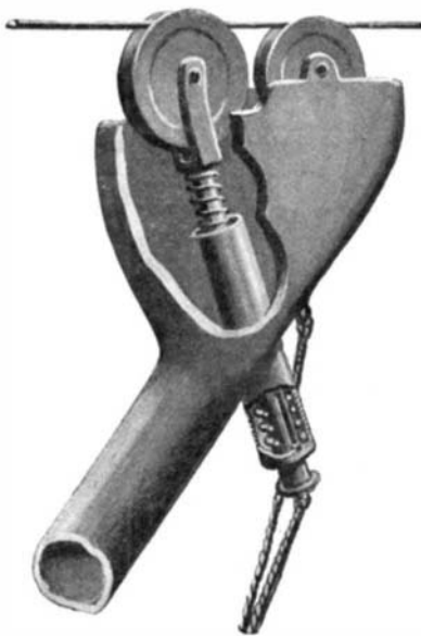
AN IMPROVED TROLLEY.

With the purpose of overcoming the common liability of a trolley to run off a trolley wire, an inventor in Texas has devised the double wheel trolley illustrated herewith. One of the wheels is secured to the trolley harp in the usual manner, while the other is mounted yieldingly therein. The latter, or auxiliary trolley wheel, is journaled in the forked end of a rod which fits in a tube secured to the harp. A spiral spring in the tube and coiled about the rod serves to press the auxiliary wheel outward. Both of the wheels serve as conductors for electric fluid, and owing to the peculiar manner in which the auxiliary wheel is mounted, it retains its true engagement with the trolley wire, irrespective of jumping or swinging of the pole. A cord is attached to the rod which carries the auxiliary wheel, and when it is desired to draw down the pole for the purpose of clearing crossings and overhead structures, this cord should be pulled,