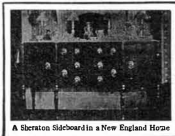
A MINIATURE ENGRAVING

DURING 1907 ARTICLES WILL BE PUBLISHED ON THESE SUBJECTS: