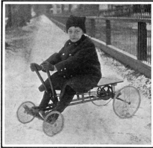
A NEW TYPE OF TOY AUTOMOBILE.

The accompanying illustration shows a new kind of toy automobile recently invented and placed on the market. The machine is known as the Exer-ketch, and it differs from most toy autos in that it is hand-driven by levers instead of being propelled by the feet. It consists of a U-shaped iron frame carrying at its rear end a large spur gear that meshes with a pinion of