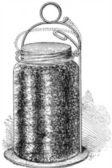
SAFETY CAN LIFTER.

In canning certain kinds of food, it is customary to place the filled jars or cans in a kettle of water, and place the latter on the fire. Then when the water has come to a boil, the jars are sealed. The task of removing the jars from the boiling water without scalding the hands is rather difficult. To render this task safer, Mrs. Emily A. Austin, of Bethel, Sullivan County, N. Y., has invented the can lifter illustrated in the accompanying drawing. The device is extremely simple, consisting merely of a base plate on which the can rests, a standard, and hinged to the latter a bail, which is adapted to be swung over the neck of the jar. The standard consists of a pair of wire legs bent to form an eye at the top, which serves as a handle, and a pair of eyes at the sides, to form bearings for the bail. The latter, which is of horseshoe shape, is formed with a handle bent upward, so that by raising the handle the bail can be swung up clear of the top of the can. In this raised position it may be held by slipping the handle over a hook at the top of the standard. In use the base plate is passed under the jar or can, and the handle is unhooked, permitting the bail to fall over the neck of the jar. The jar may then be easily lifted out of the kettle, and thereafter removed from the holder by raising the bail. The entire operation is performed without touching the jar with the hand.