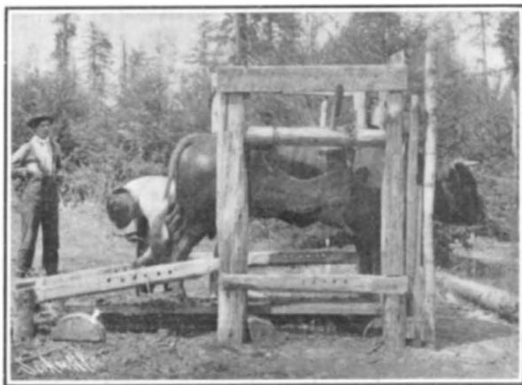
SHOEING AN OX.

With the gears placed in neutral position, the machine by the aid of this belt pulley may be employed for stationary purposes, such as the driving of a pump, or other auxiliary machinery. The complete weight of the roller is approximately 5,000 pounds, the weight being so distributed that about two-thirds of the weight is imposed upon the rear driving roller.