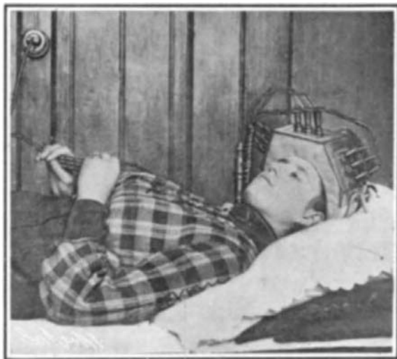
A NEW REMEDY FOR SEASICKNESS.

The driver's seat is placed on the right-hand side,