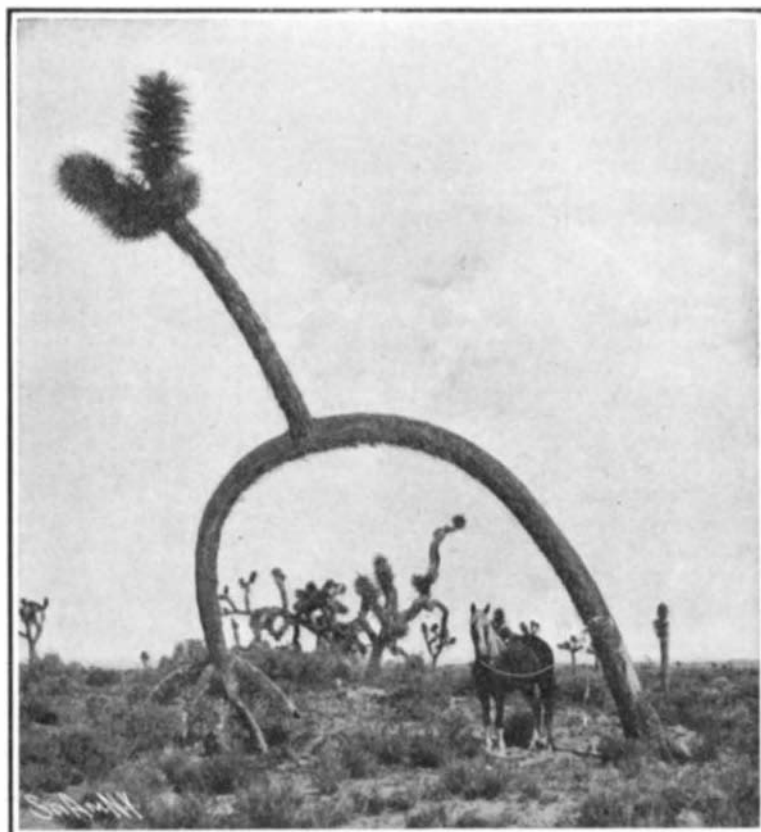
AN ARCHED YUCCA TREE.