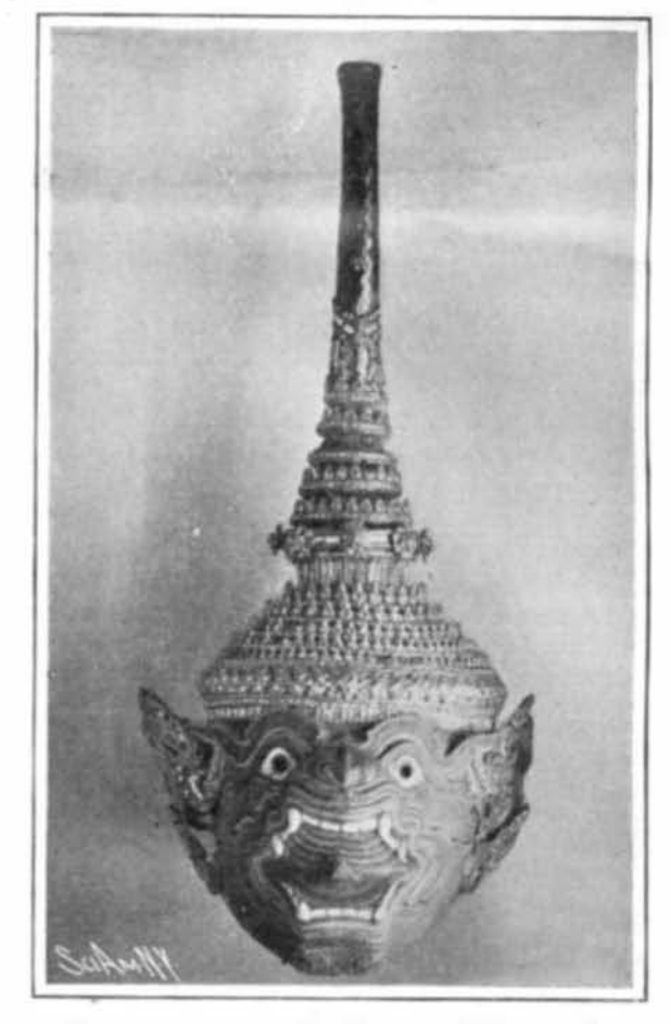
Tiger-God Mask of the Siamese, Which Is Worn During Theatrical Performances.

The Peruvians seem to have used masks from much the same motives as prompted their use in Mexico and in the northern coast of America. In their festive rites and processions some are clothed in lions' skins, their heads inclosed in those of the beasts, because they believe that the lion was the founder of their