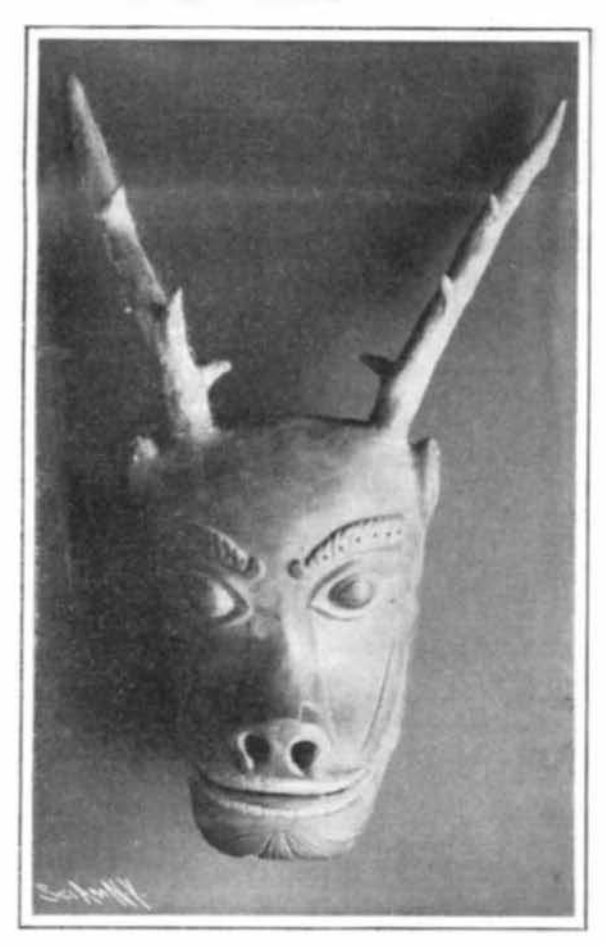
Ladak Mask from Tibet.