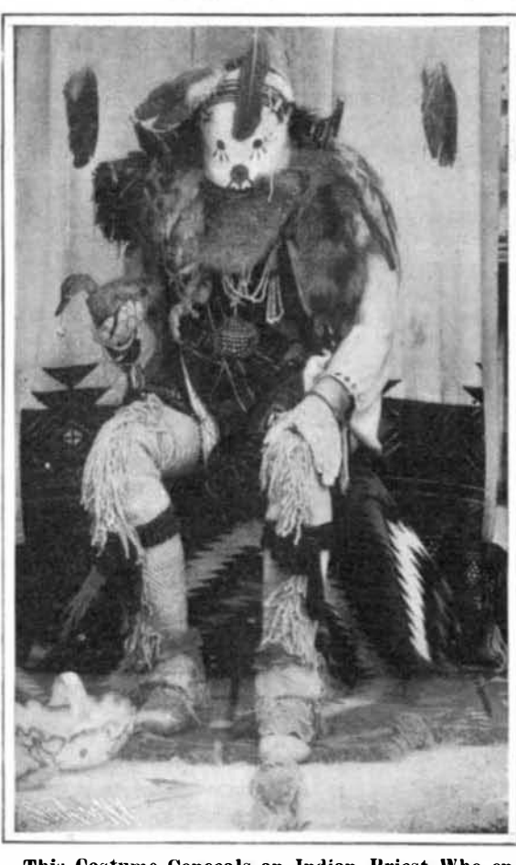
This Costume Conceals an Indian Priest Who on Donning It Becomes a God Described in the Zuni Creation.