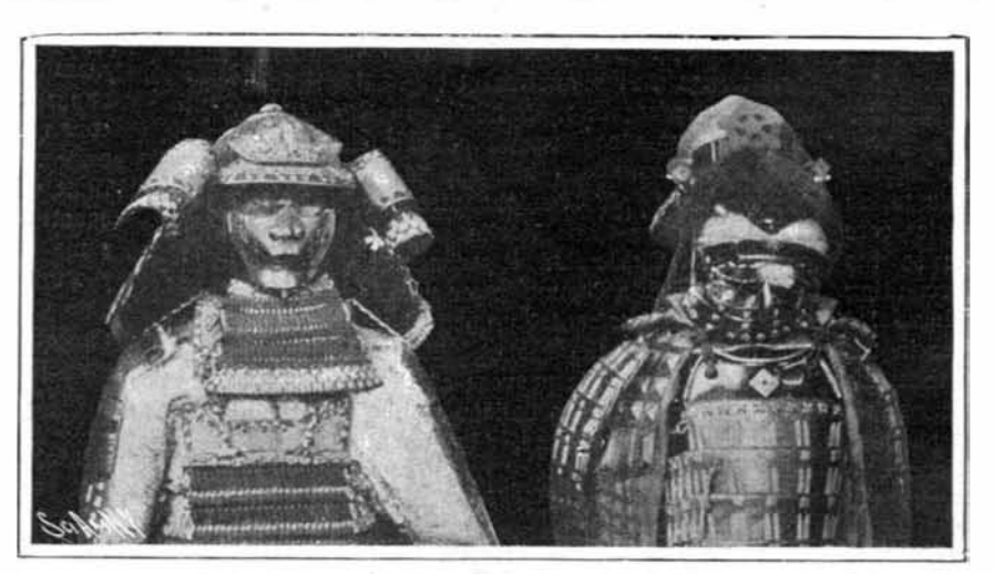
Feudal Japanese Masks for Terrifying an Enemy.