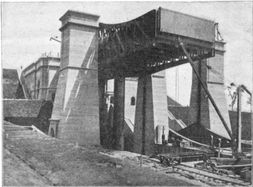
Peterborough Lock in Course of Construction.