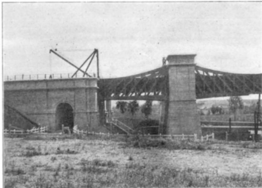
A General View of One of the Peterborough Locks.