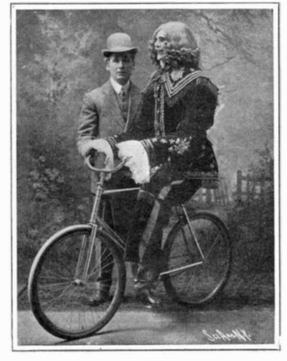
The Automaton Riding a Bicycle.