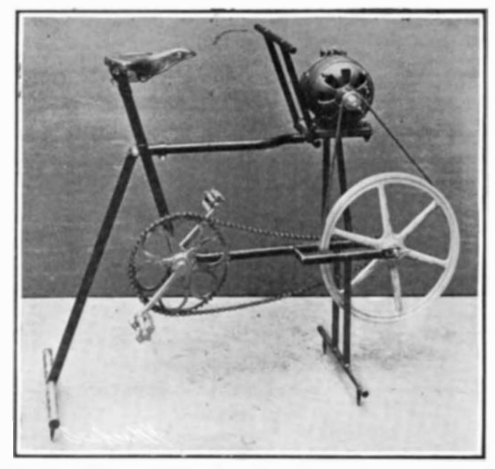
A BICYCLE GENERATING STATION USED BY THE GERMAN ARMY'S WIRELESS TELEGRAPH CORPS IN THE SOUTH AFRICAN CAMPAIGN.

Another purpose for which the current is used is for the small electric lamps employed for the treat-