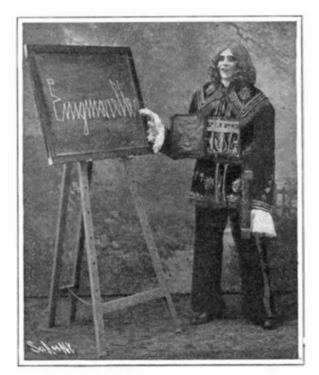
Automaton Writing. Chest Mechanism Exposed.

A CLEVER MECHANICAL AND ELECTRICAL AUTOMATON,