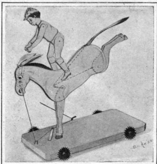
A NOVEL TOY.

During the trials which were made in the cotton fields in North Carolina and Alabama, it was found that eight horse-power was ample to give the machine necessary momentum with its force of hands, also to operate the picking and transferring mechanism. The rate of speed in the fields varies of course according to the amount of cotton to be picked. Where a large proportion of the bolls are open the field is covered in less time than where a small quantity of cotton is ready to be gathered, but it is obvious that with devices which can be guided as described, only the mature cotton need be gathered. As the picking belts revolve at the rate of about 350 feet per minute and eight of the pickers are in continuous operation, the capacity of the machine is much greater than where expert negro labor is employed. During the tests in Alabama the machine moved at the rate of 31 feet per minute, picking three rows of plants simultaneously. In a day of ten hours it covered nearly five acres. The operators were young negro boys, constituting all of the manual labor with the exception of the engineer. In this trial the machine harvested 3,000 pounds of cotton in a day at a total cost of $4.75, including fuel and wages. At the usual price paid for cotton pick-