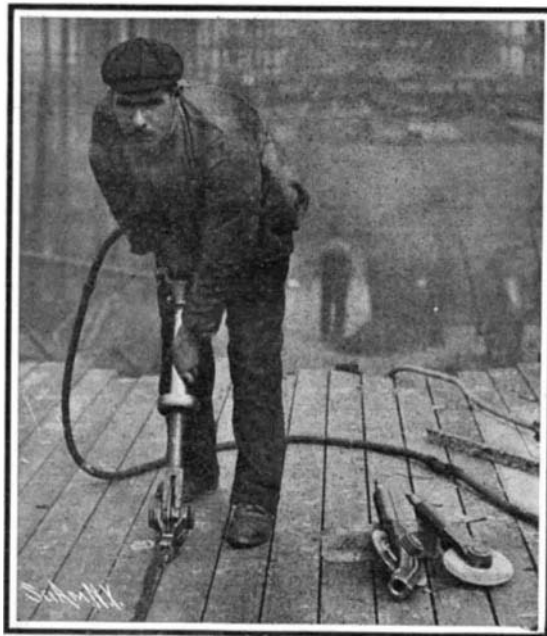
PNEUMATIC DECK-CALKING TOOL IN OPERATION, SHOWING SEAM OPENER AND CALKING IRON WITH PNEUMATIC HAMMER.

Numerous devices have been designed for supplanting the tedious, laborious, and protracted system of calking the decks of vessels by hand labor, but these efforts have not proved completely successful, since