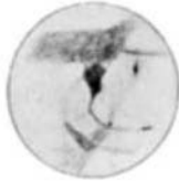
Lowell's Drawing of Martian Canals.

Inasmuch as such fine detail as the canals, owing to the air-waves, play bo-peep with either observer or camera, it is not that the more should appear in they turn out to ing so than could pated. And this posures could not taneous, but with twelve inches, average eight sec-