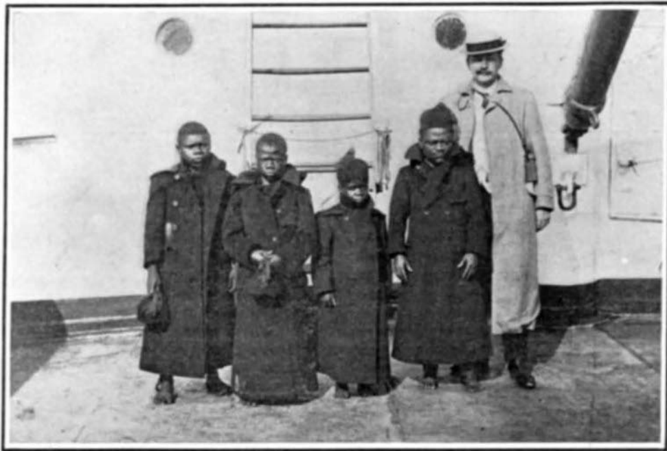
A GROUP OF CONGO PYGMIES TRAVELING FROM AFRICA TO EUROPE.

In Africa, the Dark Continent, a name for the imaginative to conjure with, have been found many of these explanations of mythological traditions. And it now appears that another, one of the commonest of all, has been deprived of its supernatural possibility as the result of African exploration. The belief in the former existence of fairy-like races of dwarfs, goblins,