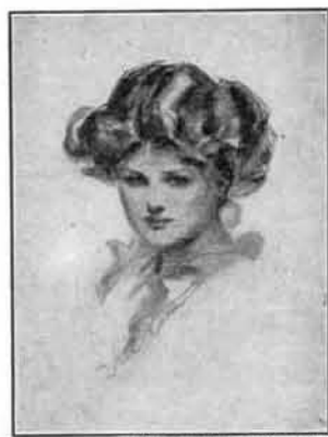
A Study in Pastel

WIRELESS TELEGRAPH, $7.50. Powerful transmitting coil, sending key, coherer, de-coherer, very sensitive relay, batteries, 100 feet aerial wire, insulators, ground clamp, full instructions, two pages of diagrams. Most remarkable outfit in the world. Send for Illustrated Bulletin. New England Coil Winding Company, Atlantic, Mass.