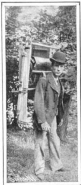
Carrying the Boat.

In America the so-called problems of agriculture have been largely those of the mere conquest of land. They are the result of migration, and of the phenomenal development of sister industries. They have resulted from a growing, developing country. They have been largely physical, mechanical, transportational, extraneous—the problems of the engineer and inventor rather than the farmer. The problem has not been to make two blades of grass grow where only one grew before, but how economically to harvest and transport the one blade that has grown.