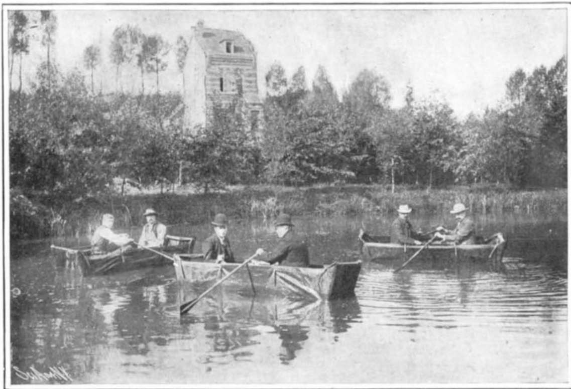
The Portable Boat Afloat.