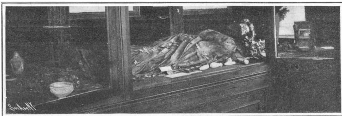
The Body of Khelmis.

From its smaller size, straighter shoulders and more asinine form the mountain zebra is less adapted for the service of man as a beast of burden or draft animal than the Burchell's zebra; nevertheless, although it is a more difficult animal to handle and break in than the comparatively larger and stronger animal referred to, it