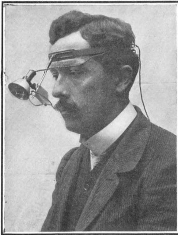
A BINOCULAR HEAD LENS.

A metallic band surrounding the forehead is fixed to the head by means of a thin spring steel band susceptible of adjustment according to the size of the head; this carries a hinged tube containing another thinner and extensible aluminium tube, which is the