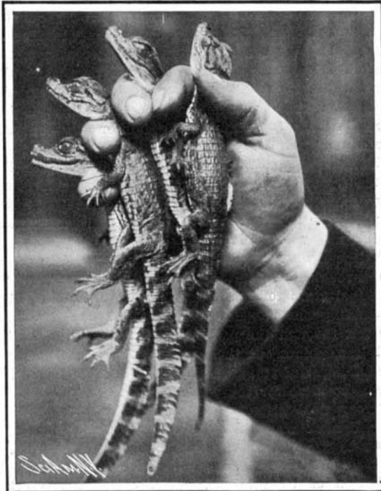
A HANDFUL OF ALLIGATORS.