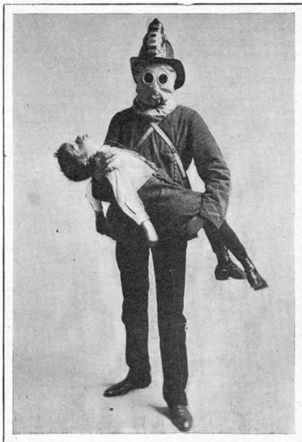
A Hood Lined with Oiled Silk Covers the Head of the Fireman.

Compound for Anatomical Preparations.—Mix first, hot, 16 parts of wheat flour beaten with as much cold water, and add 32 parts of boiling water, with 2 parts of pulverized gum arabic dissolved in 4 parts of boiling water, and boil the mixture over a gentle fire. On the other hand, dissolve 2 parts of pulverized alum in 4 parts of boiling water, and pour, stirring, into the first mixture, which is to be kept on the fire. After perfect homogeneity has been secured, add 2 parts of acetate of lead dissolved in 4 parts of boiling water. Finally, stir energetically and add about 1.50 parts of corrosive sublimate. This compound is antiseptic, but it must not be forgotten that it is poisonous.—Cosmos.