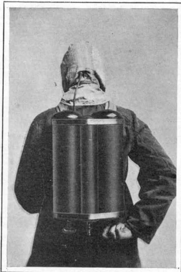
An Air Cylinder is Strapped on the Back of the Fireman. Enough Air is Carried to Last an Hour.