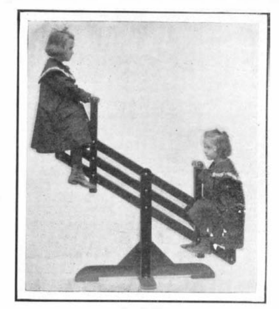
A NEW TOY.

The central post, consisting of two similar and parallel pieces, is erected upon a suitable base. In this case the longitudinal member of the base is firmly bolted between the two pieces of the central post, rigidly joining it with the base, and at the same time separating the said pieces at the proper distance. The