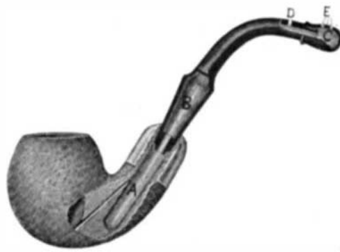
A NOVEL TOBACCO PIPE.

however, cannot in any way be sucked into the mouth. A small air hole is drilled into the stem just above the nozzle. Ordinarily this is covered with the lip, but, when desired, this hole may be uncovered, permitting the entrance of air into the stem, which mixes with the smoke and further cools and dilutes it. In this way the smoker can vary the strength of the smoke he is drawing in.