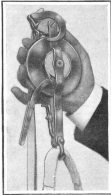
AN EFFICIENT PORTABLE FIRE ESCAPE.

In the accompanying engraving we illustrate a small but very efficient fire escape, which will be found useful in hotels, or may be kept in the home, ready for use in case of emergency. No hotel is perfectly fireproof, and