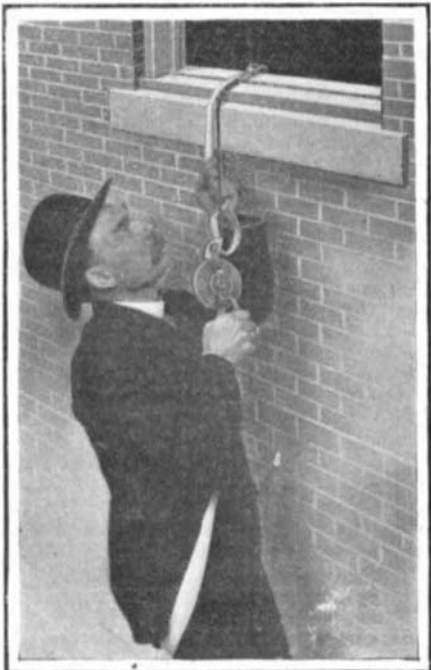
METHOD OF USING THE FIRE ESCAPE.