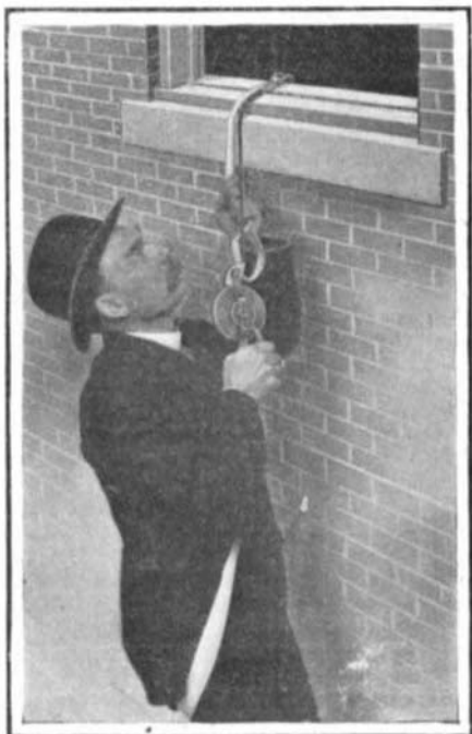
METHOD OF USING THE FIRE ESCAPE.