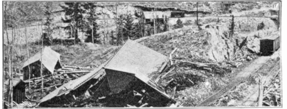
Ruin Caused by an Avalanche at Amer, Colorado.