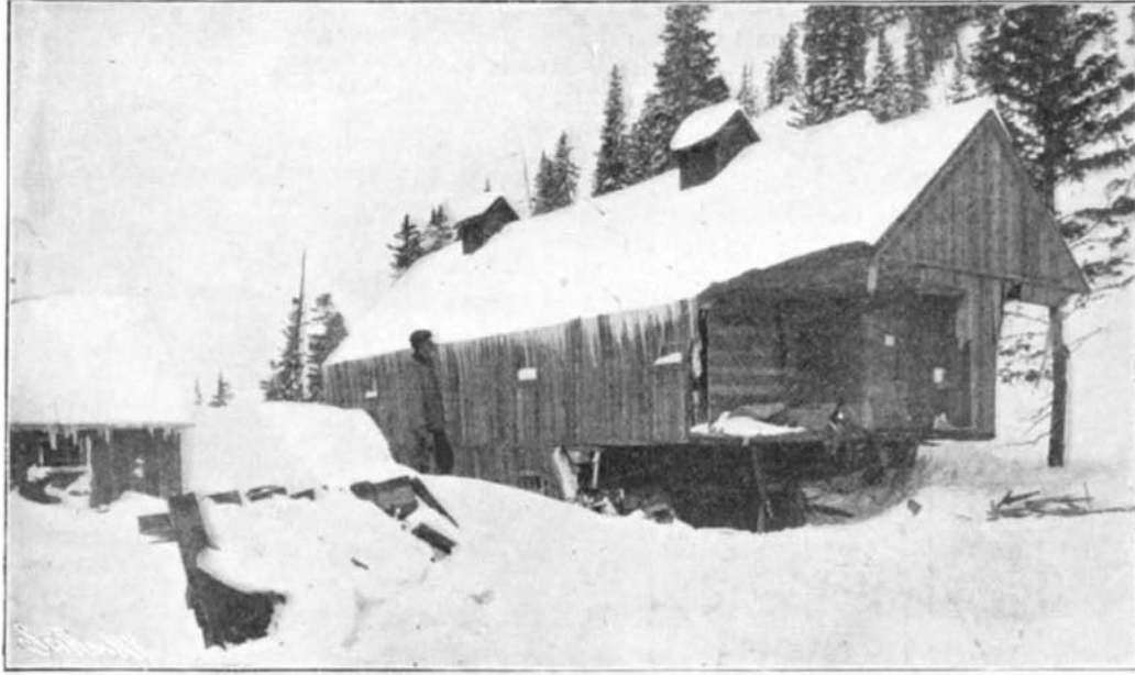
View of One of the Buildings Partly Wrecked.

While avalanches or snowslides frequently occur in the Rocky Mountain region, and many of them are of great magnitude, what is known as the San Juan district in southwestern Colorado is especially notable for these movements, owing to the formation of the ranges. Several of the peaks are over 13,000 feet in height, and the conditions are especially favorable for the motion of the snow, as the mountain sides are deeply cut with gulches, which form numerous routes. Consequently, not only in winter, but during the spring, miners and others working on the slopes of the mountains are obliged to be continually on the lookout, for frequently without warning an avalanche will descend with such