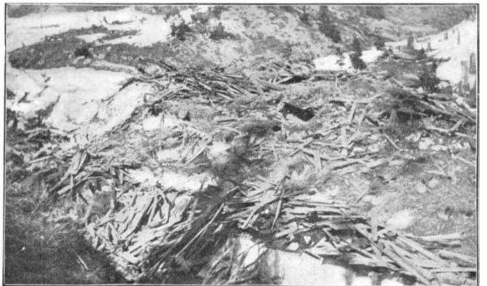
Scene in the Valley After the Slide.