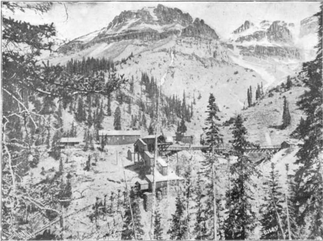
Mining Plant in the Outskirts of Telluride, Colo., Where One of the Most Destructive Slides Occurred.

Despite the caution exercised by the people on the mountain side, many fatalities have occurred, especially in the Telluride mining district, which is located in the San Juan region. The worst disaster thus far recorded occurred when a settlement in the vicinity of the Liberty Bell mine was struck. All the buildings in the path of the avalanche were destroyed. The wing of one of the mine buildings was torn away, and two engineers were buried in the snow. A party (Continued on page 166.)