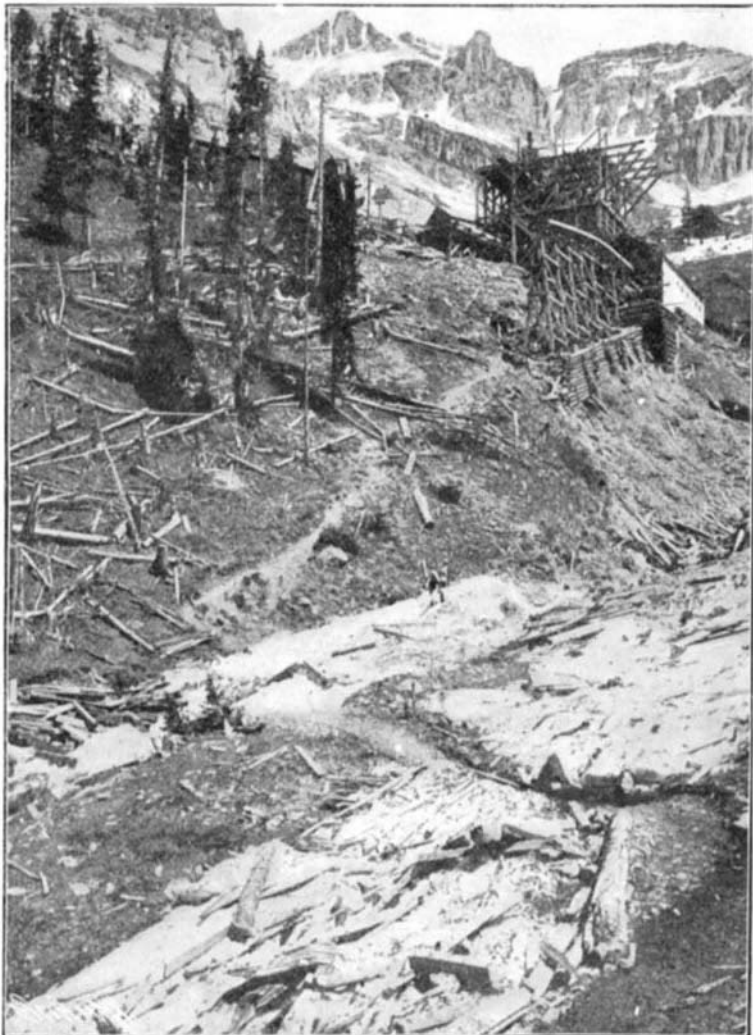
How the Forest Was Denuded by the Slide.