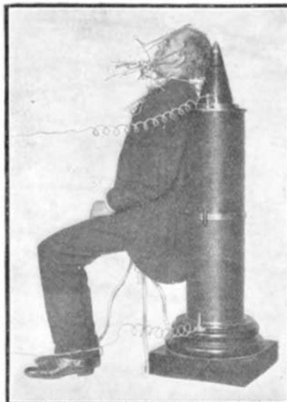
Pieces of Iron and Steel Held in Place by Magnetic Attraction.