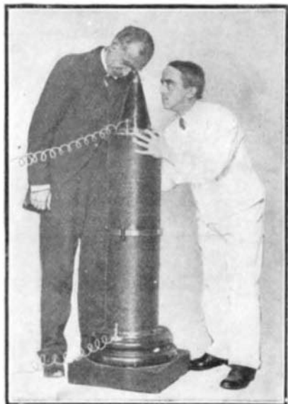
Position of Patient When Removing Steel from the Eye.

Since then, at the Bridgeport hospital, pieces of steel have been removed from the hand. In one case a chip of steel had been embedded in the palm of a man's hand for a year and a half, and in another a piece had been in the back of the hand for seven years.