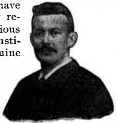
PROF. NIELS R. FINSEN

has proven eminently successful in America. We have permanently relieved many serious cases at our Institute by our Genuine High Power Finsen Lamps imported from Copenhagen. This treatment is not a cure-all, but it is sure in many diseases heretofore regarded as incurable, as Lupus (skin consumption), Eczema, Psoriasis, Skin Cancer, Birthmarks and Facial Blemishes. It is knifeless, painless, harmless. We have special books describing each of the above and other skin diseases in detail and giving names of cured patients. They are free. Write for the book you desire.