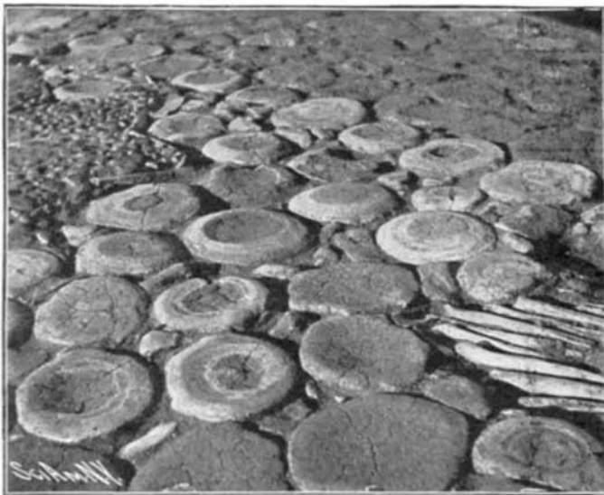
A PAVEMENT OF THE VERTEBRÆ AND BONES OF WHALES.

One of the most picturesque towns in California or on the Pacific Slope is Monterey. Historically, it is the most interesting town in the Western States. It