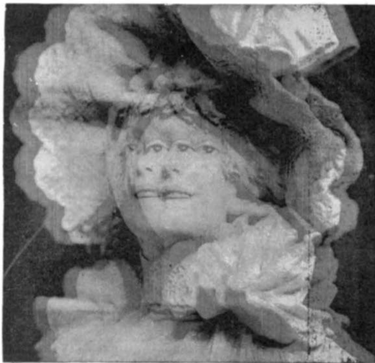
COMPOSITE PICTURE OF TWO STEREOSCOPIC VIEWS, EACH COVERING ALTERNATE STRIPES.

The negatives are now superposed so that the stripes left blank on one exactly coincide with the stripes of the other containing the picture. As can be seen from the accompanying illustration, the result is anything but beautiful. The screen and picture, properly spaced, are mounted in a frame, which when held up to the