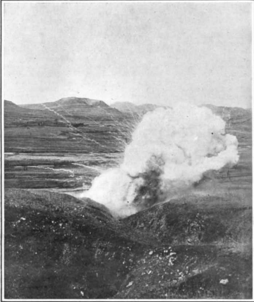
The camera has caught the flying fragments of the powder boxes and pieces of burning powder. Explosion of a Mine on One of the Manchurian Battlefields.