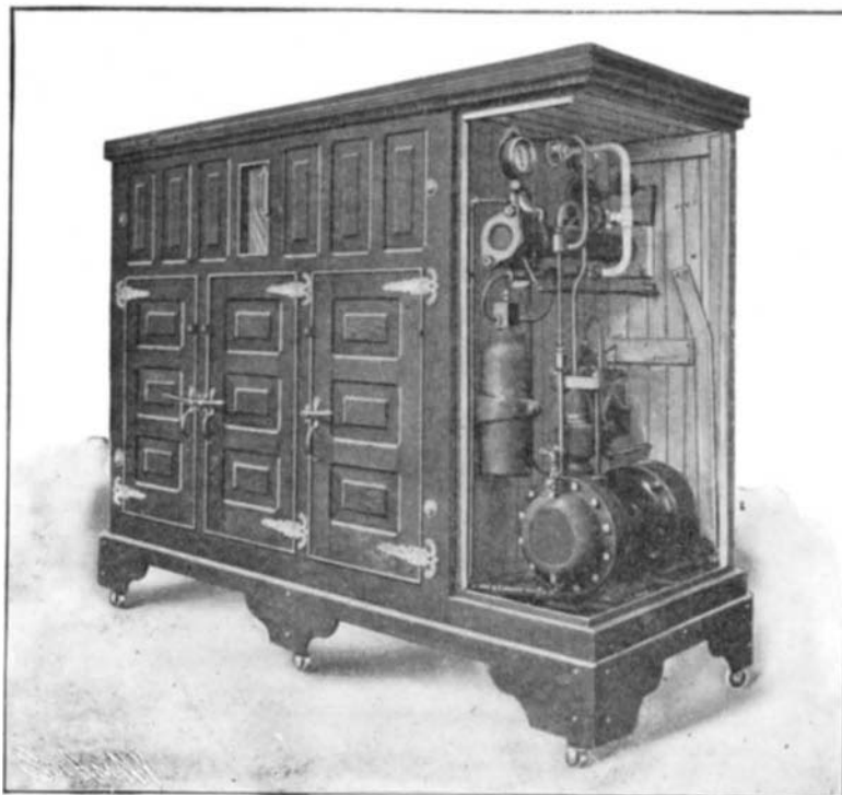
ARTIFICIAL REFRIGERATION ON A SMALL SCALE.

Ever since the perfection of the cold storage plant money and brains have been expended in producing an iceless refrigerator. It was generally conceded that there was a demand on the part of dairymen, soda