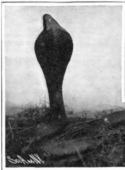
BLACK COBRA. REAR VIEW.