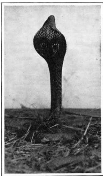
DARK SPECTACLED COBRA. REAR VIEW.

In many parts of India a cobra of any of these varieties is simply called "Kāla sámp," or "Nág sámp."