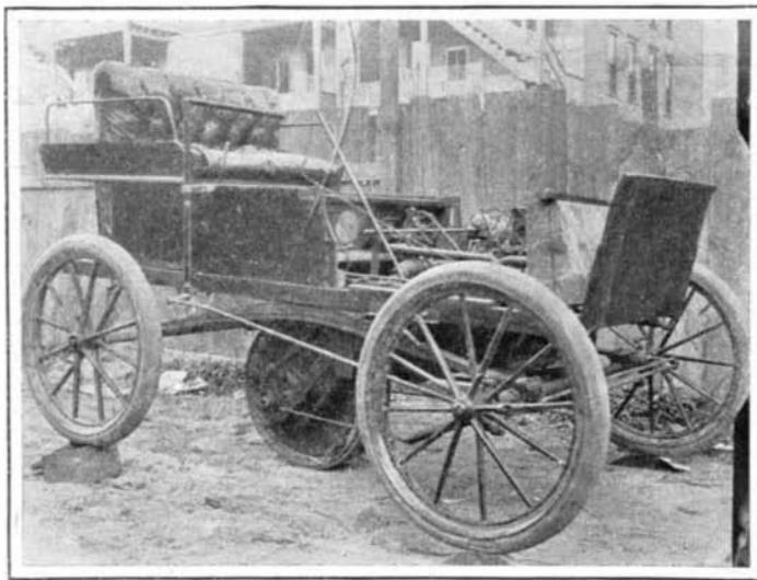
The Machine with Bonnet Removed, Showing Small Amount of Machinery Beneath.