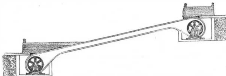
DIAGRAM SHOWING CONSTRUCTION OF THE ROLLING ROADWAY.

sufficiently to clench the pile as if it was in a vise. Then as the tide rises two or three feet, the ice coating raises the pile out of the mud bottom. As the tide falls, the weight of the surrounding ice causes the ice in contact with the pile to break off. Another cold spell freezes the water around the pile, repeating with the recurrence of the tide the same operation.