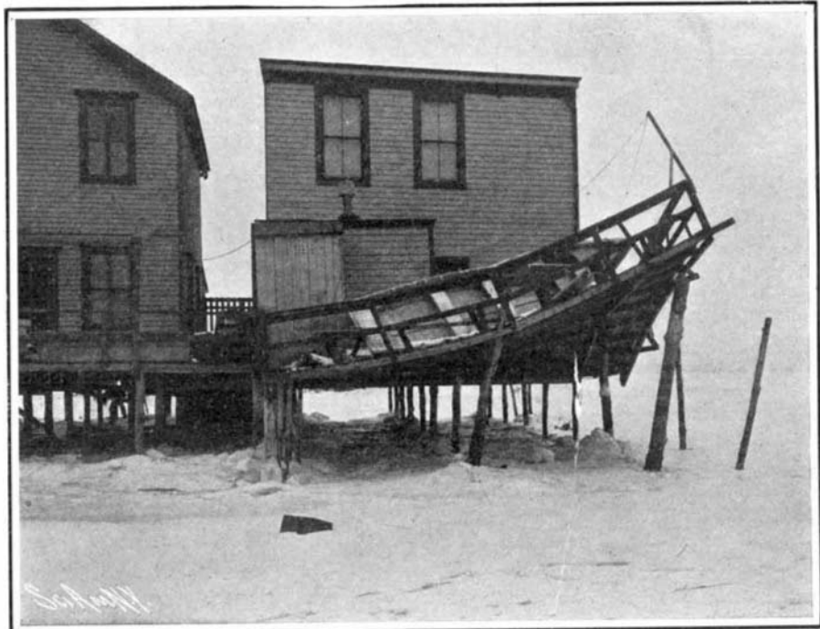
THE UPLIFTING OF BUILDING FOUNDATIONS BY ICE IN JAMAICA BAY, NEW YORK.