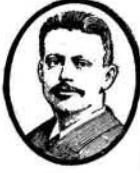
PROF. NIELS R. FINSEN