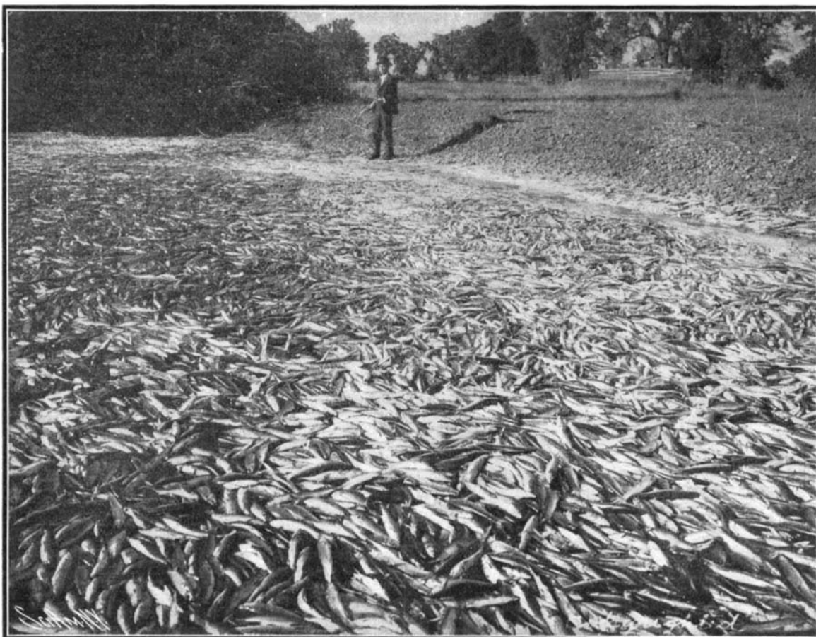
A RIVER OF FISH—KELSEY CREEK, CALIFORNIA.

can rediscover the combination of metals from which the Egyptians, the Aztecs, and the Incas of Peru made their tools and arms. Though each of these nations reached a high state of civilization, none of them ever discovered iron, in spite of the fact that the soil of all three countries was largely impregnated with it. Their substitute for it was a combination of metals which had the temper of steel. Despite the greatest efforts, the secret of this composition has baffled scientists and has become a lost art. The great explorer Humboldt tried to discover it from an analysis of a chisel found in an ancient Inca silver mine, but all that he could find out was that it appeared to be a combination of a small portion of tin with copper. This combination will not give the hardness of steel, so it is evident that tin and copper could not have been its only component parts. Whatever might have been the nature of the metallic combination, these ancient races were able so to prepare pure copper that it equaled in temper the finest steel produced at the present day by the most scientifically approved process. With