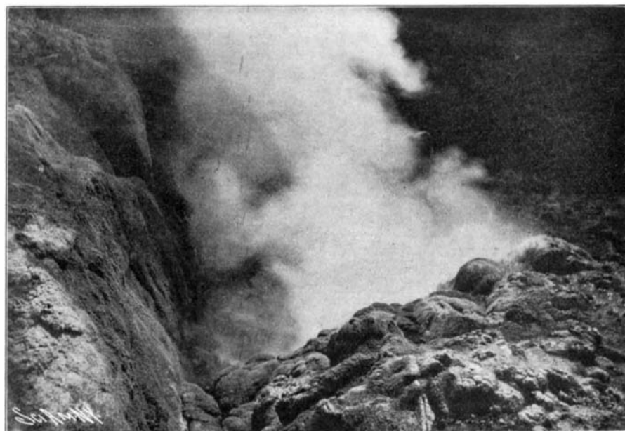
The Wavieki Geyser.