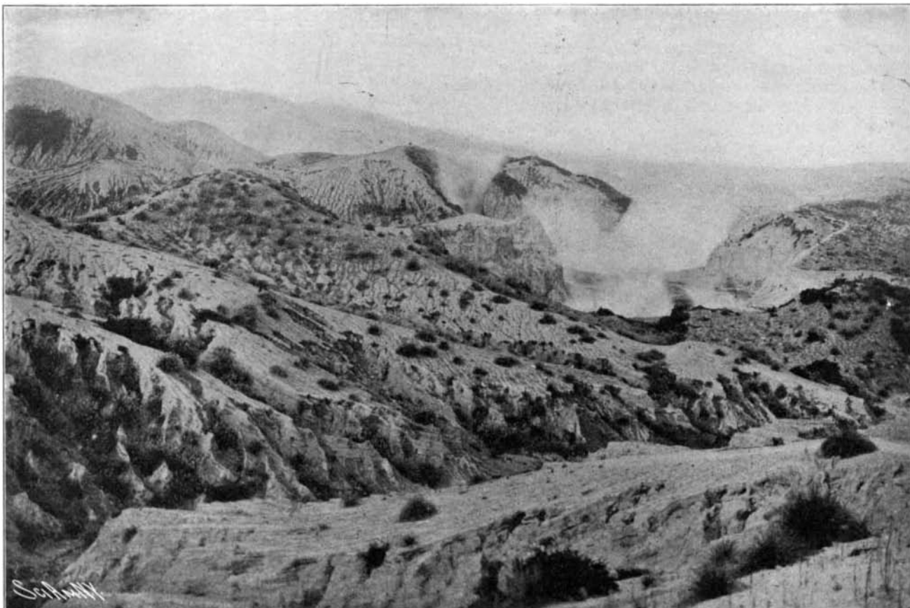
The Great "Waimangu" Geyser.