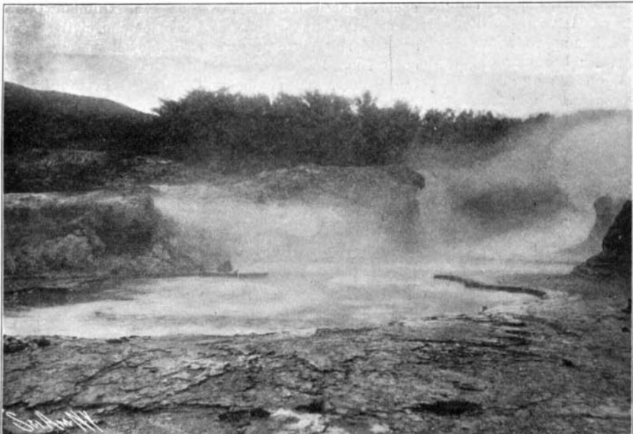
"Hell's Gate," a Pool of Boiling Mud.

The crater out of which Waimangu issues is fully half an acre in extent, and of enormous depth. When in eruption the whole of this gigantic funnel is filled