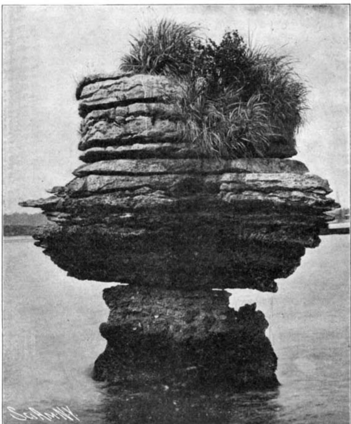
The "Wine Glass"—a Great Limestone Formation.