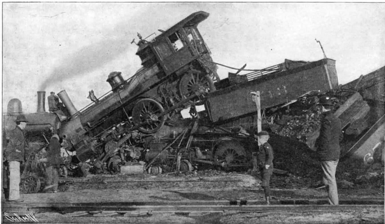
A DESTRUCTIVE HEAD-ON COLLISION IN WHICH THREE LOCOMOTIVES FIGURED.

is a small supply of water, it will pump all of it out as fast as it runs in; several wells can be run from one power by connecting air-supply pipes thereto, and the power need not be at the well, but wherever most convenient. The inventor of this pump is Mr. E. Hastain, at Tishomingo, Indian Territory.