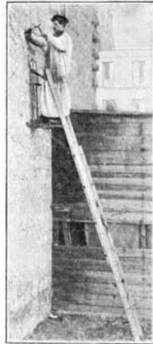
Using the Platform of the Ladder Against a Wall.