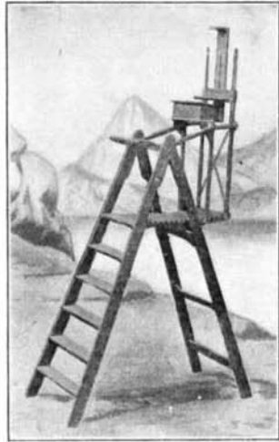
Ladder Arranged for Artists' Use.

Now that the conversion of railroads to electric traction is rapidly taking place, involving in the majority of cases the laying of the third supply rail, it is desirable that means should be adopted to prevent employes coming into contact with the same. An ingenious protection for the live conductor rail has been introduced upon the market by an English engineering firm. The idea comprises a complete system of insulated protection for the live rail, unaffected by varying climatic conditions. Strong arched or semi-arched sections of metallic shields are attached to special insulating blocks attached to the live rail. These shields are fitted in lengths, so that in the event of an accidental contact, the current is confined only to the length of the part affected.