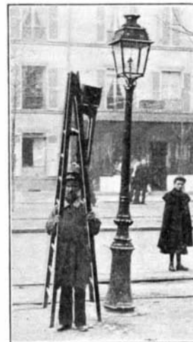
How the Ladder is Carried.