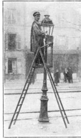
How the Lamplighter Uses the Ladder.