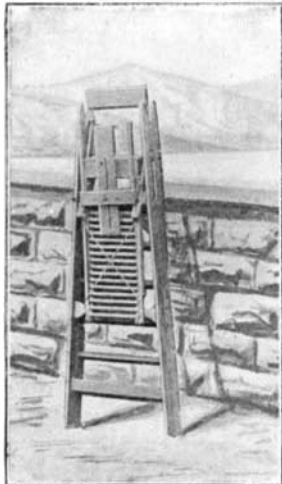
The Artists' Ladder Folded.