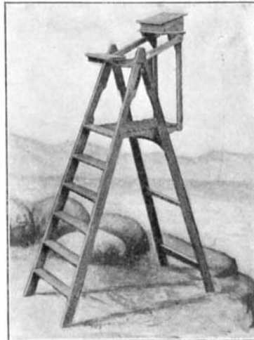
Arrangement of the Ladder for Photographic Use.