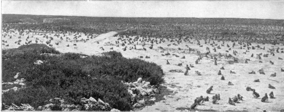
A Large Colony of Laysan Albatrosses, Mostly Young Birds.

The naturalists frequently crushed through the roofs of the petrel burrows, sinking to the knees in these subterranean