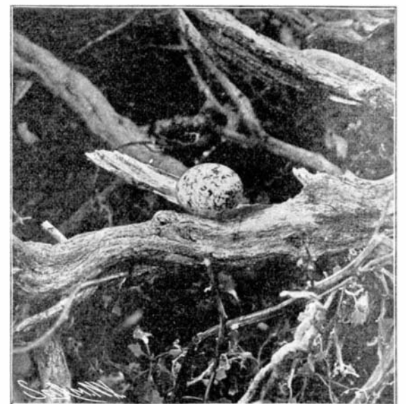
A "Nest" of Gygis, the Bare Limb of a Chenopodium Bush.