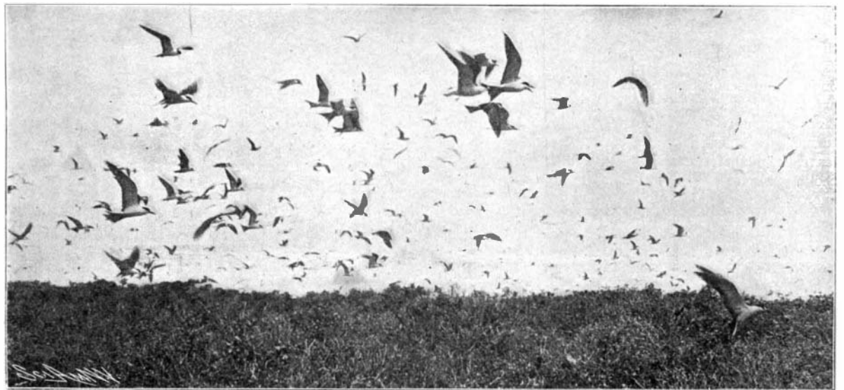
Customary Activity Over a Large Colony of Sooty Terns.