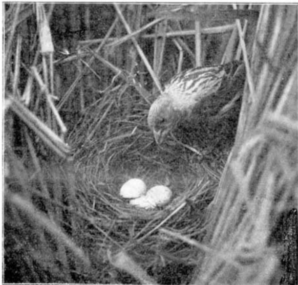
A Laysan Finch.