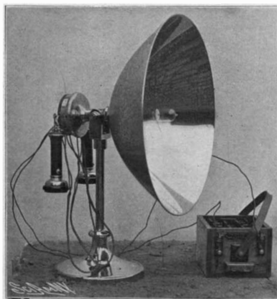
RUHMER'S CELL APPLIED TO A PARABOLIC REFLECTOR FOR OBSERVING AN ECLIPSE OF THE MOON.

Though the direct moonlight would have been quite sufficient to influence the most sensitive selenium cells. Ruhmer employed a parabolic mirror 45 centimeters in aperture in connection with a cylindrical selenium cell, the mirror concentrating the moonlight on the cell placed in its optical axis so as to produce a uniform illumination of the whole of the selenium cell. A small receiving apparatus, such as used to demonstrate optical telephony was then installed in connection with a small telescope, so as to be readily adjusted according to the position of the