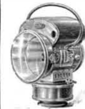
DIETZ LUCIFER ACETYLENE GAS LAMP.

Made of high grade brass and finely polished, the Dietz Lucifer Acetylene Gas Lamp, made by the R. E. Dietz Co., 60 Lighthouse St., N. Y. City, is indeed a wonderful improvement on old styles. In this Lamp the water is fed to the carbide around the whole circumference of the holder and not in single drops. This keeps a uniformly bright and continuous flame. It is also a prevention of waste, and the lamp will burn as long, by being constantly relighted, as in one continuous burning. The lamp is simply constructed and as easy to use and operate as an oil lamp, being filled in the same way. The metal is all of heavy gage brass and the top of the carbide chamber screws on. This lamp is also light in weight and has an elegant appearance. It is optically perfect and its beam of light is extremely large. Focus is not only accurately placed but adjustable.