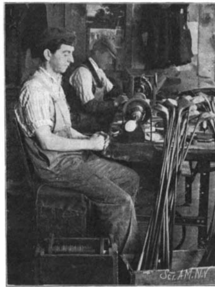
Winding the Joint of the Head and Shaft.