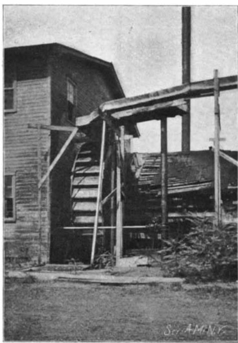
A WATER-WHEEL DRIVEN BY A FLOWING WELL.

Wood will be reduced to a minimum, and all of it, with the exceptions of decks exposed to weather and some few articles of furniture, will be fireproofed. Asbestos sheathing and mill board will cover the outer hull plating in living spaces; and metal ceiling will be fitted to the outer hull in all living quarters not sheathed with non-conducting material. Quarters will be provided for an admiral, his chief of staff, the com-