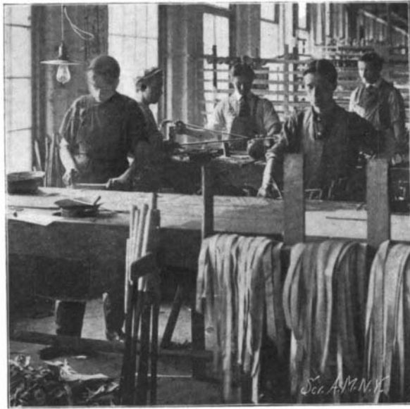
Putting on the Grip.

The 12-inch guns will be mounted in two elliptical balanced turrets, of the barbette type, with slanting faces. These turrets will have face plates 12 inches