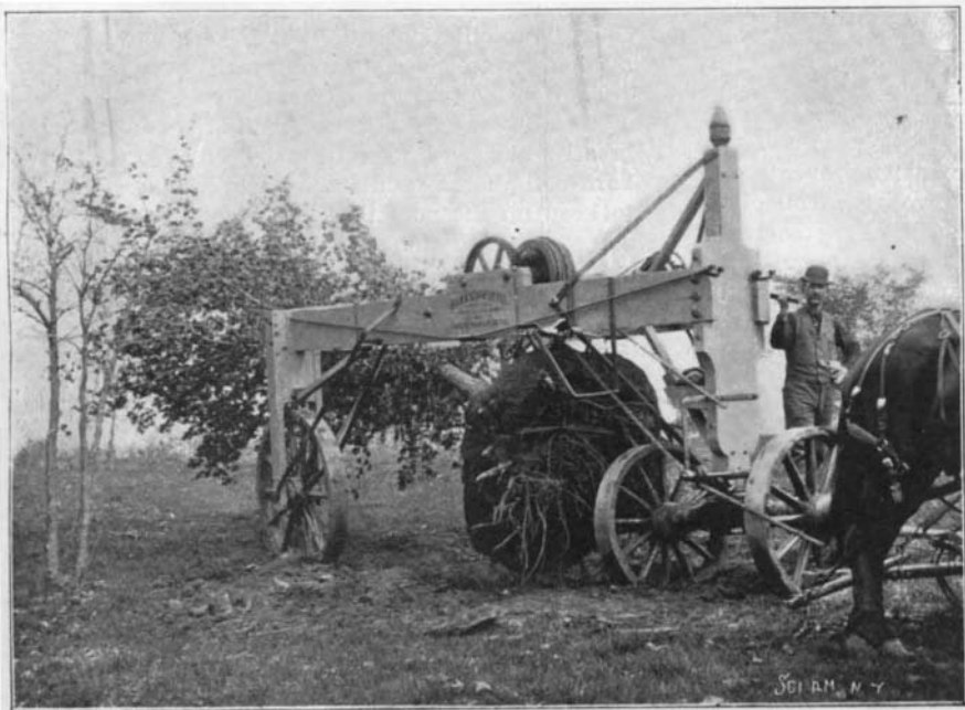
POWERFUL MACHINE FOR MOVING LARGE TREES.

As shown in our illustration, the invention comprises a lantern box, at the rear of which is hinged a reflection chamber having vertical walls arranged obliquely with respect to the front wall of the box. A light, A, for example a Welsbach light, is located at one side of the lantern box at one focus of an elliptical reflector, the picture or object to be projected being inserted at the other focus. On the opposite side an opening is formed in the reflector for the admission of the objective tube. Rays from light, A, pass through a condensing lens, B, to one of the oblique walls of the reflector chamber. Reflectors, C and D, are provided on these walls and they act to reflect the rays back through a condensing lens, E. A transparent lantern slide, F, when placed before the lens, E, intercepts the rays and permits the proper gradations of light and shadow to be projected by lens, G, onto the screen.