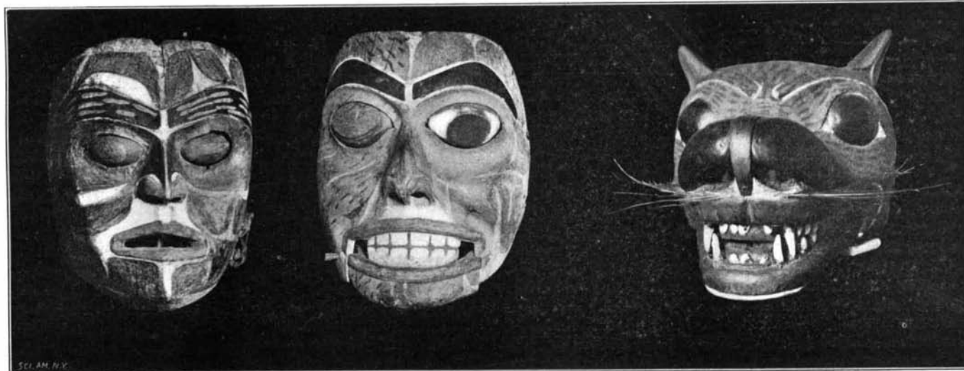
MASKS WORN BY THE COAST INDIANS OF BRITISH COLUMBIA.