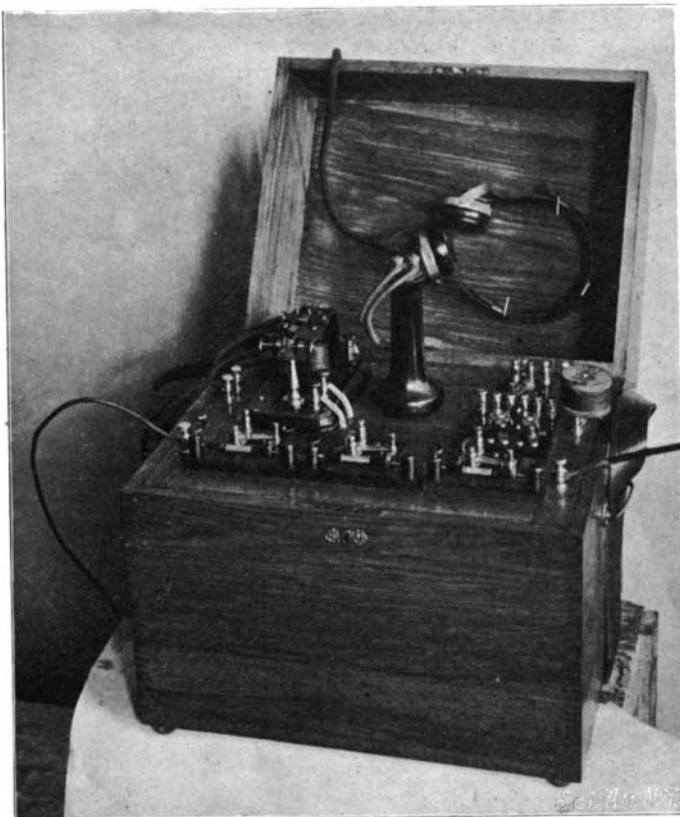
THE DE FOREST RECEIVER

receivers, attached to one and the same responder, and without any special attuning or syntony device in circuit. One message was from the Staten Island station and was sent quite rapidly, thirty words per minute, with a high-frequency spark (120 per second). The other was from some foreign station, probably a Marconi installation. The speed was about ten words per minute, sent with a low-frequency interrupter.