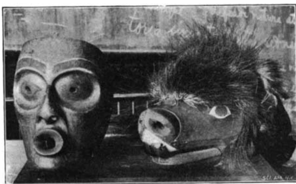
MASKS FROM BRITISH COLUMBIA. THE RIGHT-HAND MASK IS DECORATED WITH PORCUPINE SPINES.

receivers, attached to one and the same responder, and without any special attuning or syntony device in circuit. One message was from the Staten Island station and was sent quite rapidly, thirty words per minute, with a high-frequency spark (120 per second). The other was from some foreign station, probably a Marconi installation. The speed was about ten words per minute, sent with a low-frequency interrupter.