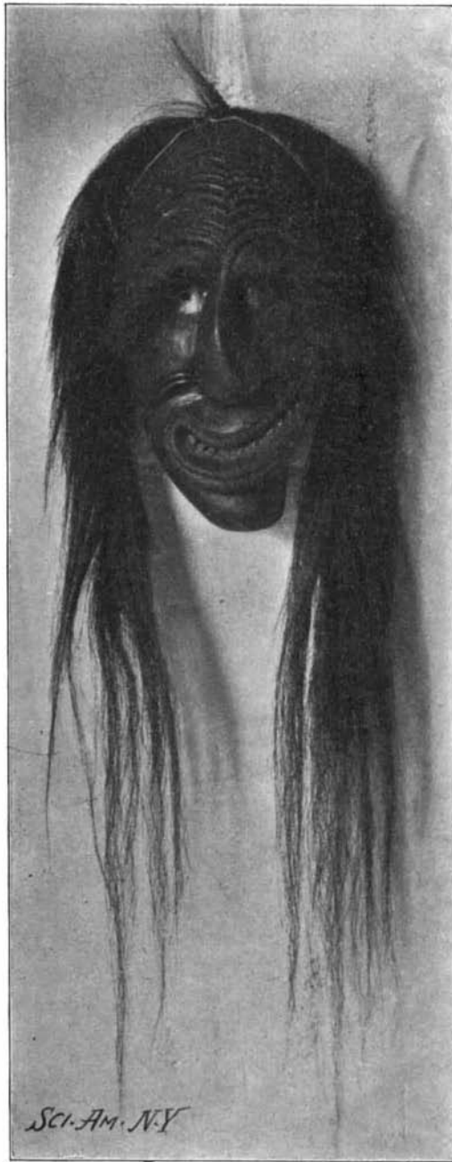
CROOKED-MOUTHED IROQUOIS MASK.

It was at first anticipated by many persons that the competition of electricity would greatly reduce the value of, even if it did not entirely ruin, the coal-gas industry, but such had not proved to be the case, the effect of the introduction of electricity having been to reduce the rate expansion of gas undertakings. The competition of electricity had, moreover, proved