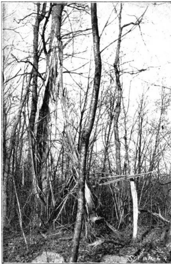
TREE SHATTERED AT THE BASE BY LIGHTNING.

skin of warty appearance, chocolate brown in color and striped with yellowish bands and spots. The tail is slightly flattened and bears no sign of a fin, nor can any fins be found on its body. In this it differs from all other morays, which have a fin extending the full