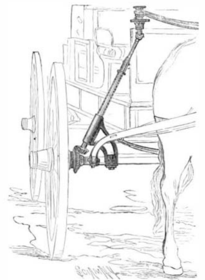
DEVICE FOR HOLDING HORSES.

tudinally ranging slots in the tube, whereby the rotary motion of the tube is communicated to the rod. At the lower end of the tube is a small bevel gear, which engages a large bevel gear on the hub of one of the front wheels. The teeth of these gears are curved outwardly, so as to allow for any uneven-