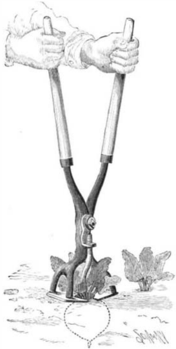
BEET-TOPPER IN OPERATION.

handle-ports spread out into a forked or bifurcated frame-section. To these sections the knives are adjustably secured, so as to permit adjustment relative to each other when worn out. The cutting edges of the knives are beveled from beneath, and their bottom surfaces are inclined, so that the heels of the knives will not engage with the ground until after the cutting process is completed, thereby avoiding friction and affording the knives a better chance to take hold of the beet at a proper depth. The gage-rod, as shown, is threaded into a