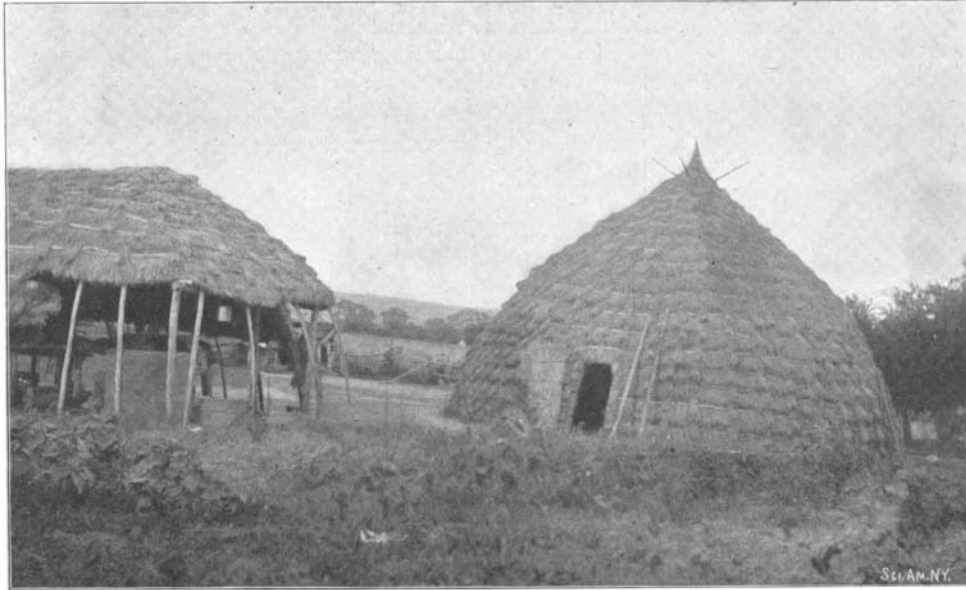
Grass House of the Wichita Indians.

A flannel rag dipped in hot water and sprinkled with turpentine is a good remedy against hoarseness. This poultice is also employed for lumbago and rheumatism. For facial neuralgia it is also said to give relief.