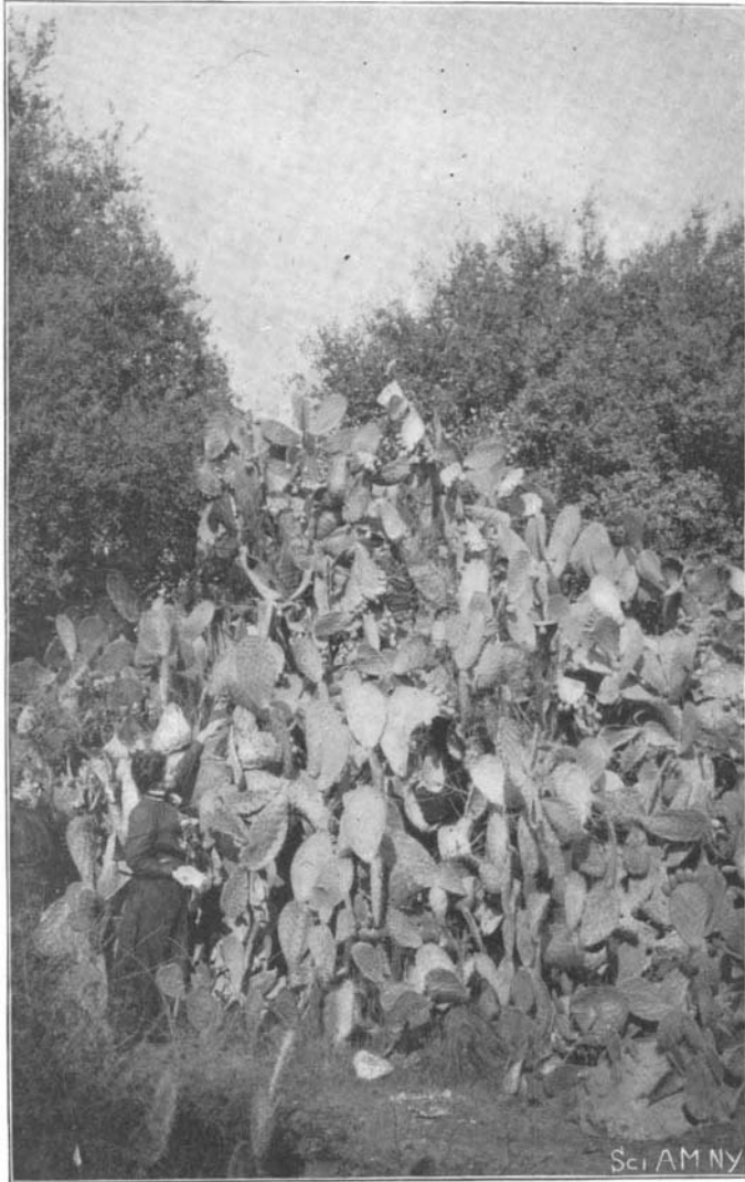
Cactus "Forest" in Which Many Birds Build Their Nests.

Almost every cactus patch in California will be found to afford similar protection, and the average hunter will invariably forego the game rather than engage the array of javelins. The various cacti, especially the variety which grows in clumps, serve as a protection particularly to birds. The writer has